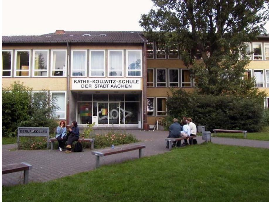
Figure 1 : Entrance area of the school before the retrofit