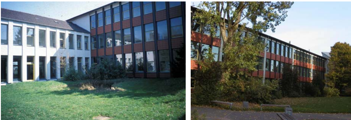
Figure 5: Photos of the auditorium (left) and the administration block (right) after the retrofit.

The retrofit is still ongoing in some parts. Therefore the users were not yet asked to evaluate the changes. However, some photos of the retrofitted building parts are available.