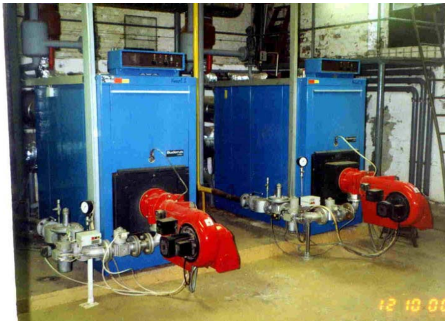
Figure 3: Photo of the gas burners before the retrofit